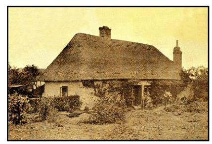
Little Gore End - 1900

"Little Gore End – or part of it – is old, and reputed to have been a smugglers